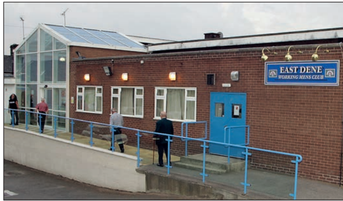
The ramp leading to the front door has been widened giving wheelchair access to the club's stunning new foyer (right).