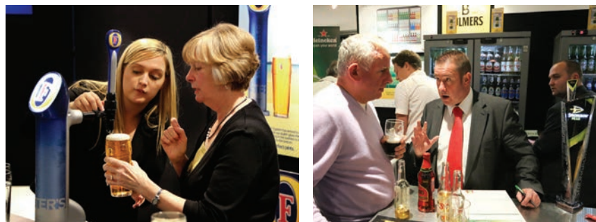
Among the presentations from Heineken in the UK were interactive demonstrations on how the Foster's Pourtal system produces the perfect pint and reduces waste, seminars on fridge layout and the launch of Strongbow Pear