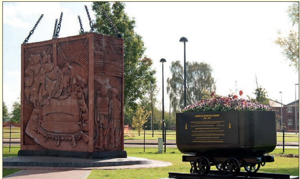
The memorial with one of the pit tubs nearby.

The monument was the culmination of 20 years of planning. For the last two years The Allerton Bywater Miners Memorial Committee has held its meetings at the nearby Edward VII Club in the village. The club has supported the Committee and held a series of fundraising