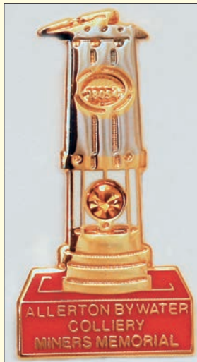
One of the badges sold by the Edward VII Club to raise money for the memorial.

A Yorkshire club has been the driving force in raising £30,000 for a memorial sculpture to those who lost their lives at a local colliery. The memorial, a sculpture in the shape of a mining cage, was unveiled on the site of the former Allerton Bywater Colliery, near Castleford. The pit closed in 1992 after 110 years in which