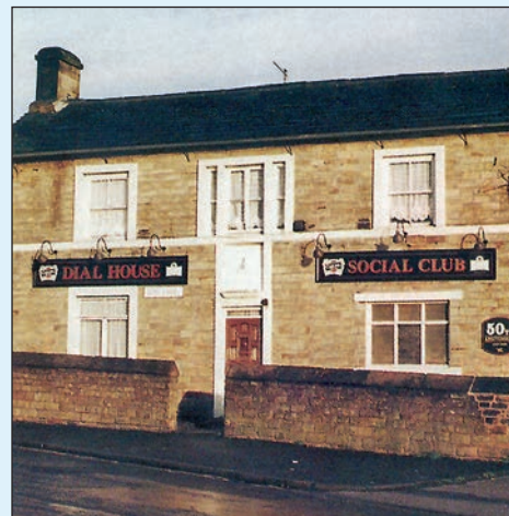
The Dial House, which was so named because it had a sundial above its front door.