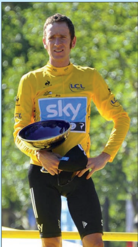
Bradley Wiggins with the Tour de France trophy about to draw the raffle.